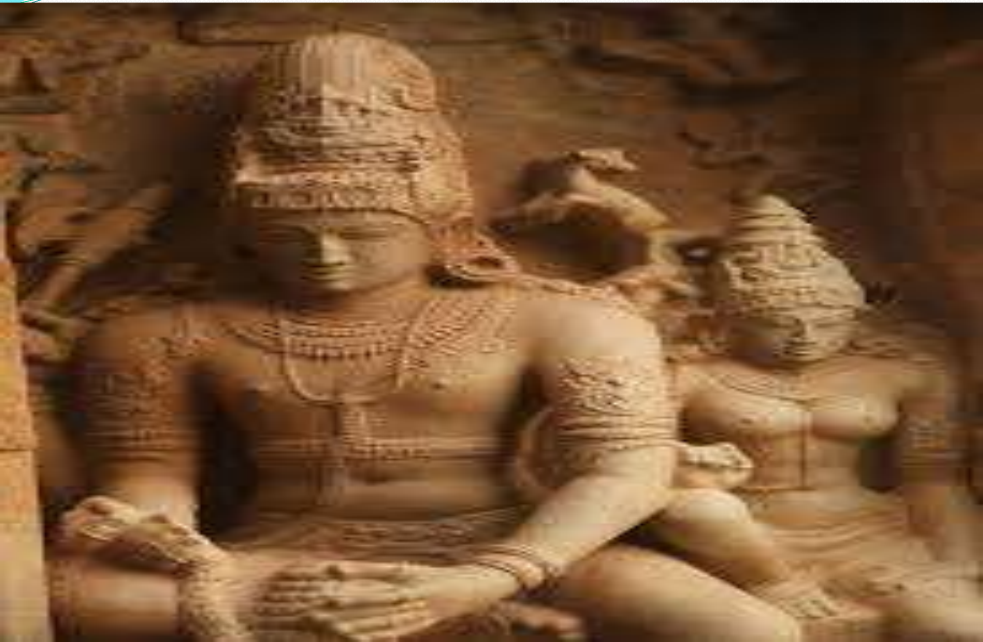
IMAGE OF RAJENDRA CHOLA