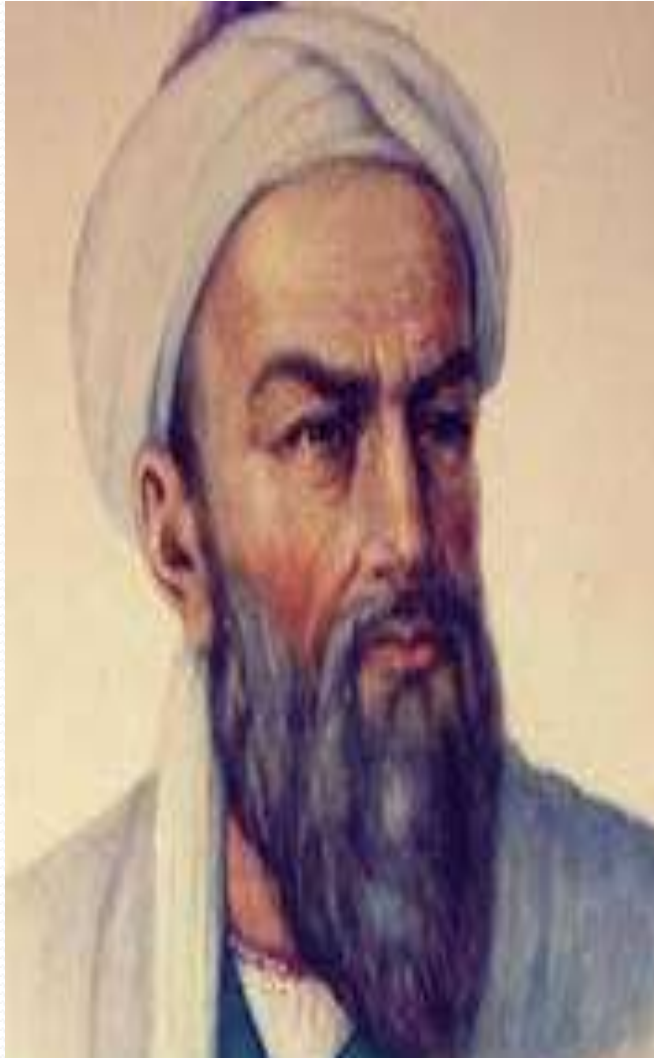
IMAGE OF AL-BIRUNI AND KITAB-AL-HIND