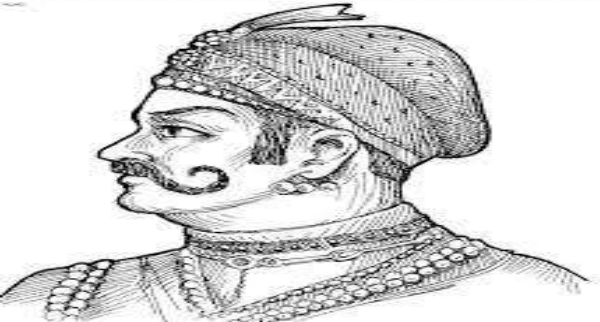
IMAGE OF PRITHVIRAJA CHAUHAN