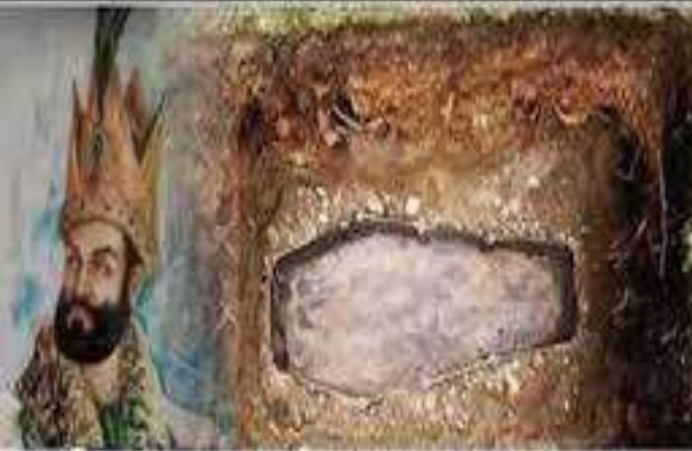
IMAGE OF SULTAN MAHMUD AND HIS TOMB